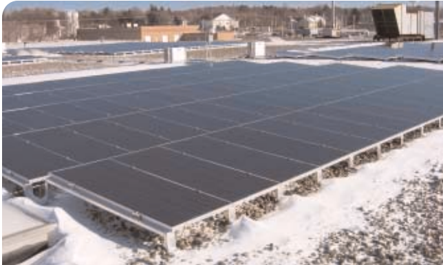
52kW Sunplicity installation, Newburyport, MA

The simple solution for PV installations on commercial, industrial and institutional buildings